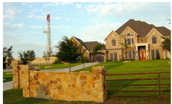
Fort Worth, Texas, is the epicenter of urban fracking. The city has at least 1,400 natural gas wells, some as close as 200 or 300 feet from people's houses.

A growing body of evidence shows that fracked gas could be worse for the climate than coal over the next 20 years because of leaks of heat-trapping methane.